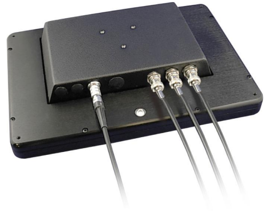
Pictured TOP: Standard DOD Series with Power and BNC (3) Inputs.